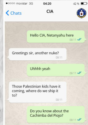
Our chat with the CIA

no one would be daring enough to get that close to it anyways.