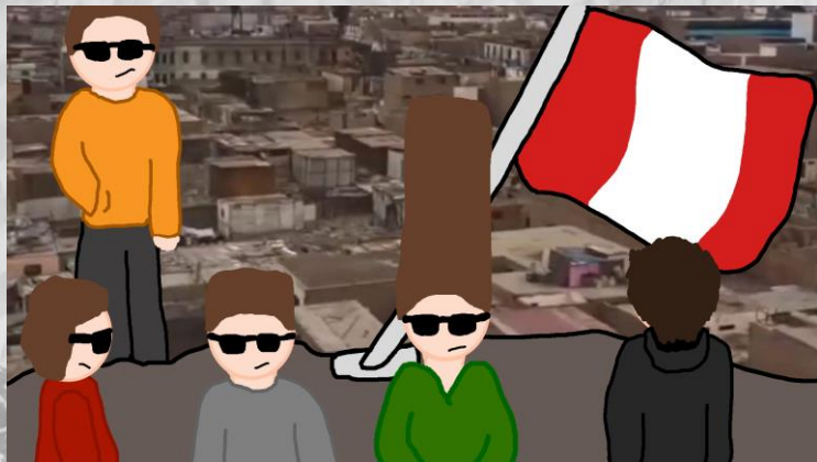
The usual ones in Lima, Perú.

We thought about blowing up a miniature model, but then we got great news from the Peruvian government. Not only they'd authorize us to obliterate up to a third of Lima, it will also come at the cost of just 17 dollars after bribes and compensations. This was obviously the chosen approach.