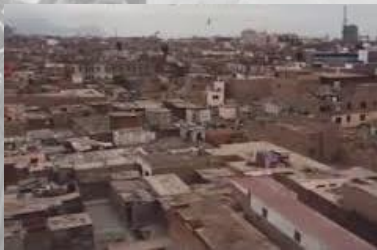
Lima before the explosion