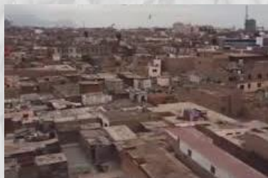
Lima after the explosion