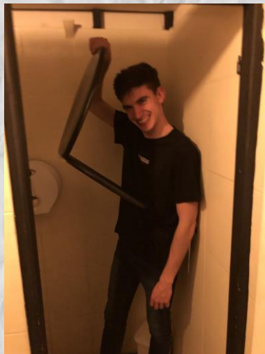
The Toilet Bandit, caught on action.

A long and time-consuming scan of the resonance frequency of the file layout revealed the exact frequencies to track down Santiago's location, it was his breadcrumb trail left by him for us to find.